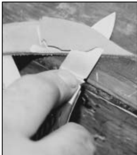
Employing the knife carefully, Gary skived a piece of 8-ounce leather with no problem.