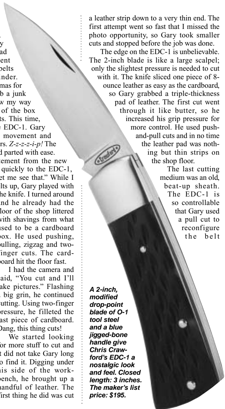
A 2-inch, modified drop-point blade of O-1 tool steel and a blue jugged-bone handle give Chris Crawford's EDC-1 a nostalgic look and feel. Closed length: 3 inches. The maker's list price: $195.