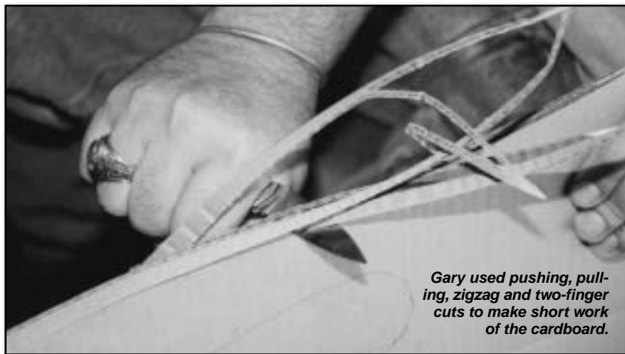
Gary used pushing, pulling, zigzag and two-finger cuts to make short work of the cardboard.