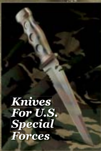
Knives For U.S. Special Forces